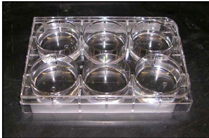
Figure 1. 6-well tissue culture plate.