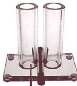
Typical gradient former casting chamber (165-2950)