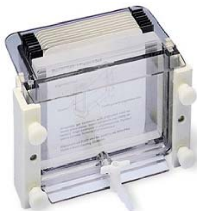
BioRad MiniProtean II gel

Native acrylamide gels can be poured by hand. While it is possible to use a single acrylamide concentration such as a straight 10% gel, MitoSciences highly recommends the use of a linear acrylamide concentration such as 6-13%. A recipe for pouring these native acrylamide gels in a 10-gel BioRad Mini-PROTEAN II multicasting chamber when using a two chamber gradient former, is detailed below.